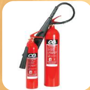
STORED PRESSURE CO2